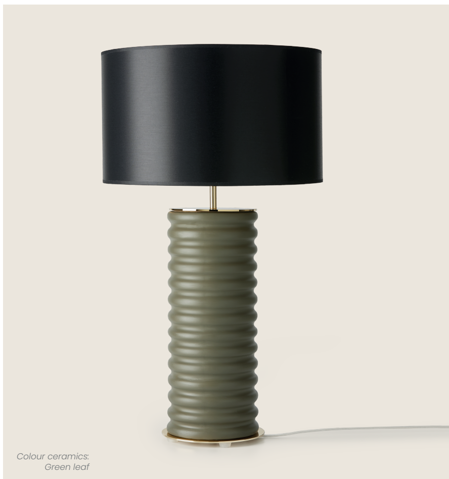
Colour ceramics: Green leaf